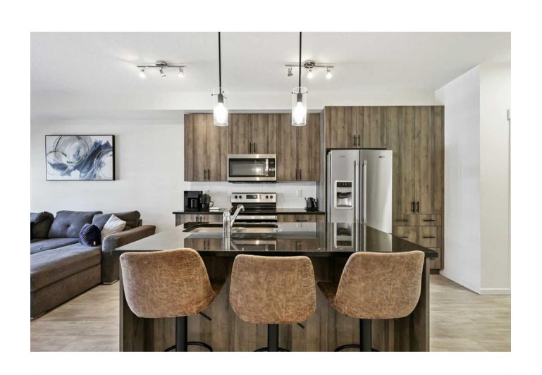
5304, 151 LEGACY MAIN STREET SE RECA MEASUREMENT STANDARD - CALGARY, AB MAIN LEVEL (AG) - 685, 04 Sq. Ft. / 63,64 m² TOTAL ABOVE GRADE RMS SIZE - 685,04 Sq.Ft. / 63,64 m²

CHECK THIS OUT!! This 3rd-floor 2-bedroom + 2-bathroom home is in "MOVE IN CONDITION" & built with numerous custom upgrades. You will fall in love with the 685 sq ft living space plus the covered WEST-facing balcony... BBQ time! The open, designed main living area features 9' ceilings with a large family room overlooking the kitchen/nook & foyer. The kitchen has upgraded cabinets, QUARTZ counter tops, modern subway tile backsplash, upgraded stainless steel appliances, an undermount stainless steel sink, and many storage cabinets. Big primary bedroom features a walk through closet & more west views. The secondary bedroom includes a full closet and can be used as a den. Plus upgraded light fixtures and a chic custom luxury vinyl plank floors, laundry room, balcony gas line, and indoor parking stalls (Titled) ... Never will you need to fight for parking on the busy streets or scrape the frost off in the morning. Check and compare the incredible value. In addition, this complex has great access to the new shopping right around the corner. **BONUS features include - Easy access to the exit staircase for walking your dog. Quick 2025 possession is available. Call your friendly REALTOR(R) today to view!